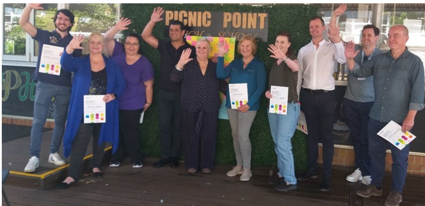
Raise Mentors – "Raise your hand to mentoring."

A huge thank you to the PPHS P&C Association for their support and funding of The Raise Program.