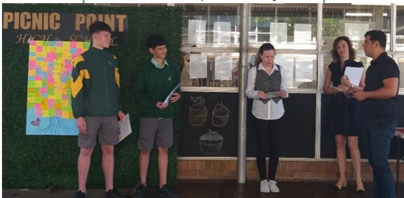
Year 9 students Raise Mentoring Graduation Ceremony