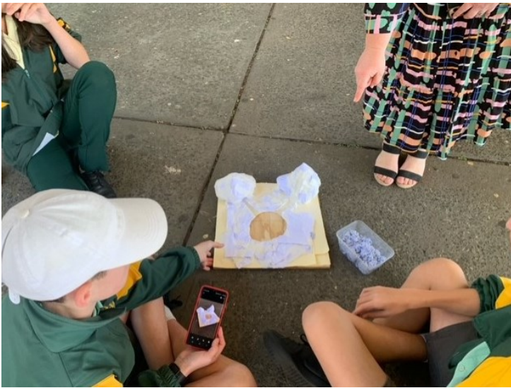
Year 8 iThrive beginning their Sustainable City Project the projects.