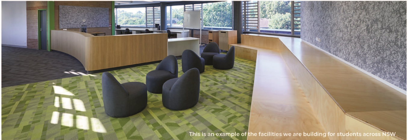
This is an example of the facilities we are building for students across NSW