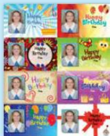
8 - Happy Birthday