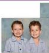
2 - 13x18cm