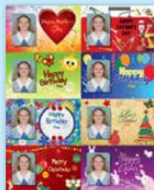
8 - Gift Cards