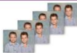
4 - 6.5x9cm