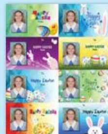
8 - Happy Easter