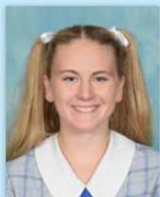
1 - 20 cm x 25 cm

Log in using your secure access key to begin customising