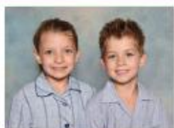
1 - 20x25cm