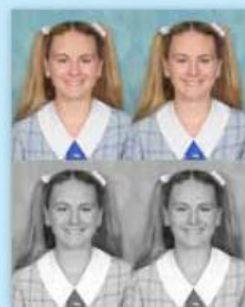
4 - 10 cm x 13cm