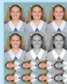
14 - Portraits