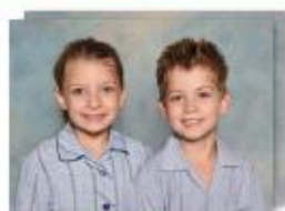
2 - 20x25cm