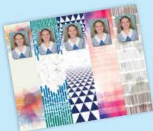
5 - Bookmarks