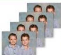
4 - 9x13cm