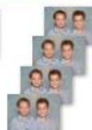
4 - wallets