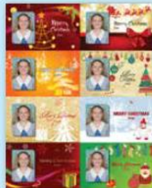
8 - Merry Christmas