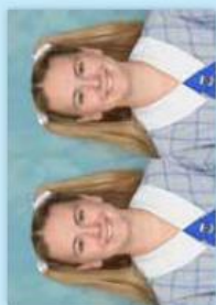
2 - 13 cm x 18 cm