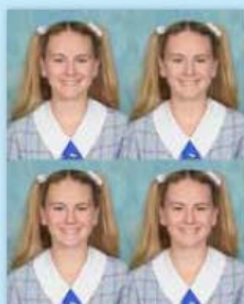
4 - 10 cm x 13 cm