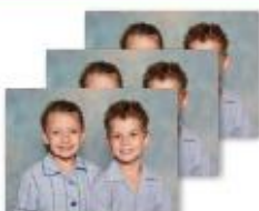
3 - 13x18cm