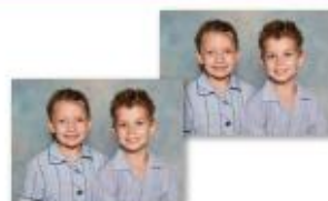
2 - 13x18cm