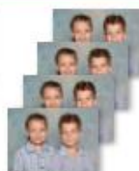
4 - 6.5x9cm