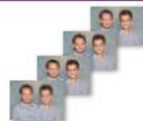
4 - wallets