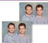
2 - 9x13cm